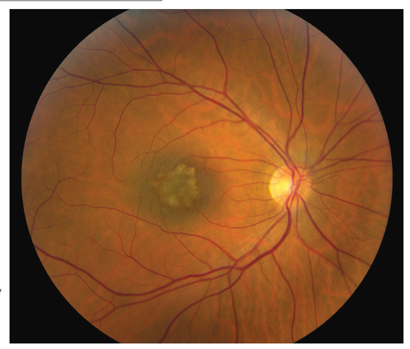
Figure 2. Small benign macular choroidal freckle/nevus.