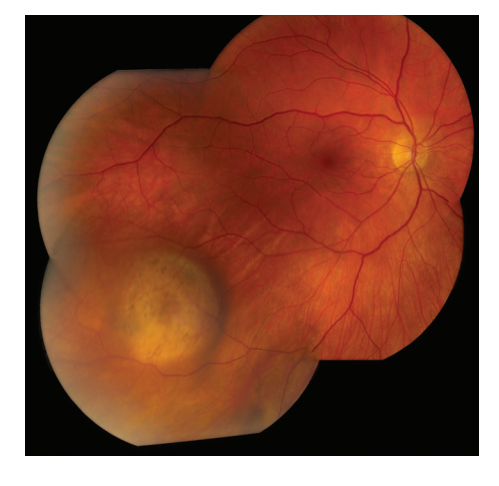
Figure 3. Small/medium malignant choroidal melanoma.