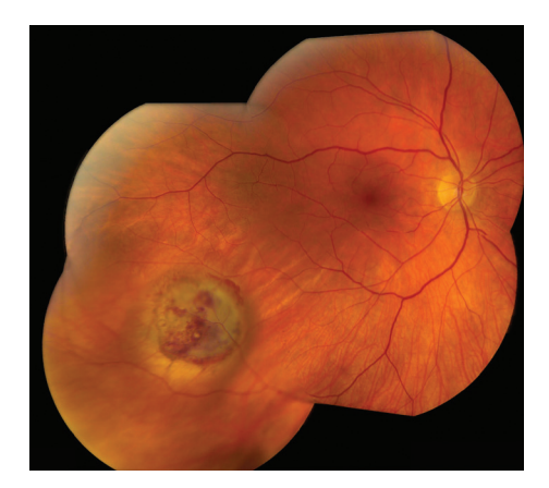
Figure 4. Small/medium malignant choroidal melanoma after brachytherapy. Tumor size reduced by 40%. Notice small bleeding from the radiation.