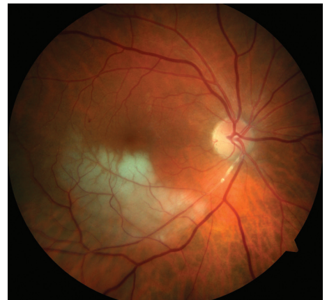
Figure 2 Branch retinal artery occlusion (BRAO) showing retinal whitening in the area of blockage. John S. King, MD. Retina Image Bank 2014; Image 18552. ©American Society of Retina Specialists.