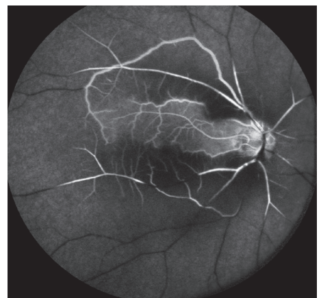
Figure 3 Fluorescein angiogram of CRAO showing sparing of the cilioretinal artery. Courtney Crawford, MD. Retina Image Bank 2017; Image 26792. ©American Society of Retina Specialists.