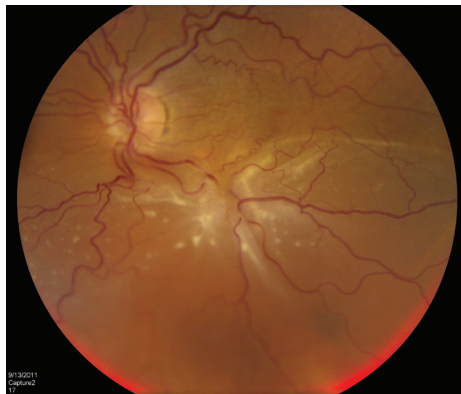
Figure 1. A patient with complex retinal detachment due to PVR in the left eye. A retinal “star fold” is present in the inferior macular with associated subretinal fluid.

PVR most commonly occurs after a previous (primary) retinal detachment repair surgery. PVR is the most common cause of primary retinal detachment surgery failure, occurring in approximately 5% to 10% of all retinal detachments. Retinal detachment with a giant retinal tear, however, is relatively uncommon.