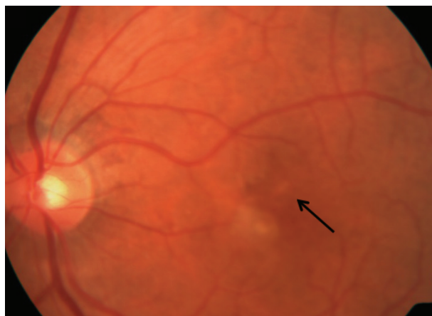
Figure 2 Wet AMD. Choroidal neovascularization (indicated by arrow).

CNV occurs when abnormal blood vessels grow beneath the retina; these can bleed or leak and cause a distortion of