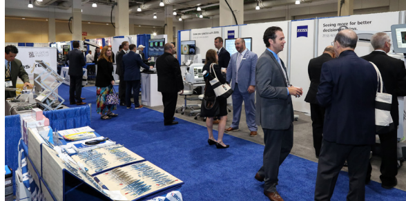
Exhibit Space and Fees